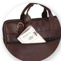
Backside Zip pocket