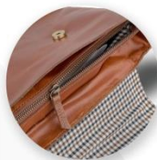
Zip Closure for Safety

"Introducing the E-01 Buff Crunch bag: crafted from premium brown leather with tan accents, it features a secure flap, spacious interior, and back zip pocket. Perfect for the modern professional, combining style and practicality. Its premium stitching ensures durability and long-lasting use."