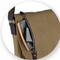
Front Zip Pocket