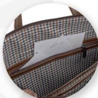
Inside Zip Pocket

"Step into the boardroom with confidence and style. The E-15 Portfolio Bag, crafted from premium croco leather, combines luxury with practicality. Its sleek design, ample storage, and professional appeal make it the ultimate accessory for the modern professional, ensuring you stand out in every meeting."