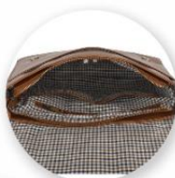
Main Spacious Compartment