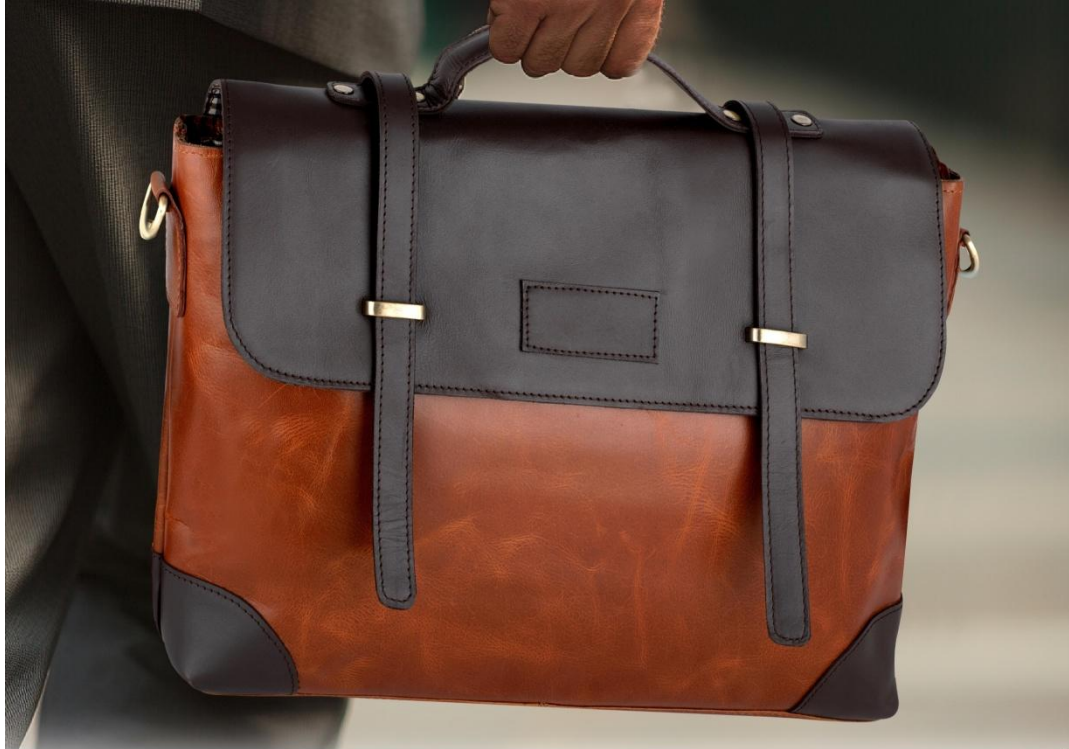
E-01 BUFF CRUNCH - BROWN WITH TAN