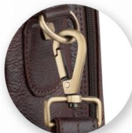
Premium Quality material