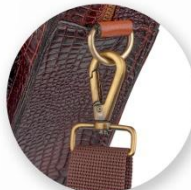
Premium Quality material