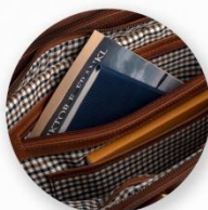
Inner Organised Compartment