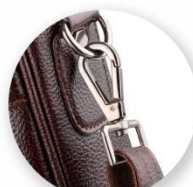
Premium Quality material