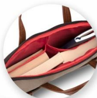
Inside Pocket view