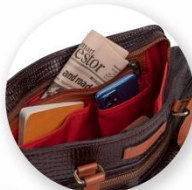
Inside Organise Pocket