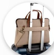
Trolley Carriage Feature