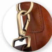
Premium Quality material