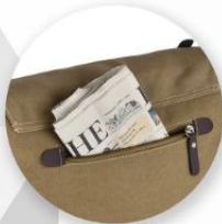
Backside Zip Pocket