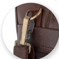
Premium Quality material