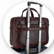
Trolley carriage feature