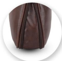
Capacity extender Zip