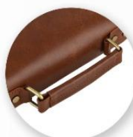
Good Quality handles