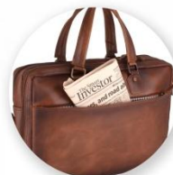
Backside Zip Pocket