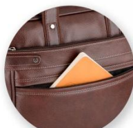
Front Zip Pocket