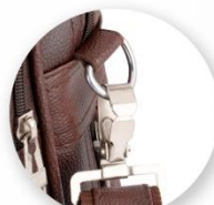
Premium Quality material