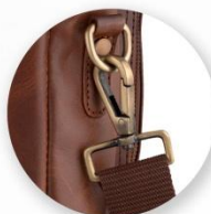
Premium Quality material