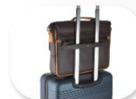
TROLLEY CARRIAGE FEATURE