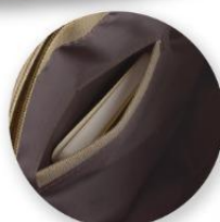
Inside secretive Pocket