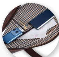
Inner Organised Compartment