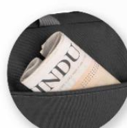
Back Zip Pocket