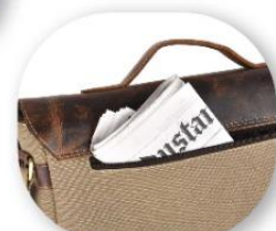
Back side Pocket