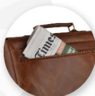
Back Zip Pocket

"Elevate your professional look with the GRACE E-16 Buff Crunch Leather Portfolio Bag . Crafted with attention to detail, this sleek and sophisticated bag ensures your 11.6-inch laptop is securely housed while offering additional storage for your necessities."