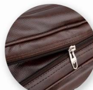
Space Extender ZIP