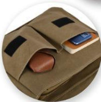
Inside upper Compartments