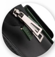
Premium Quality material