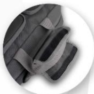
Velcro to Joint handles