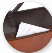
Back Zip Pocket