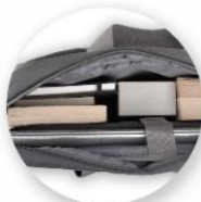
Inside Organise Pocket