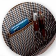
Inside Organise Pocket view