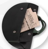
Front Flap Pocket