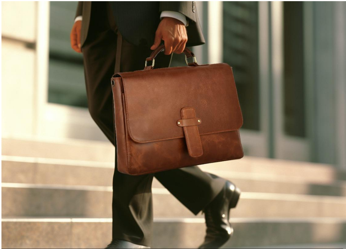
E-16 PORTFOLIO BAG - GRACE ( Buff Crunch Leather )