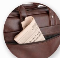
Backside Zip Pocket