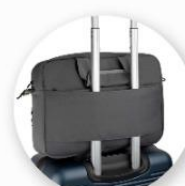
Trolley Carriage Option