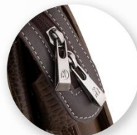
Premium Quality Material