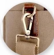
Premium Quality material