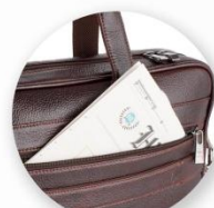
Backside Zip Pocket