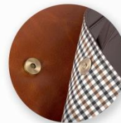
Eyelet Button Closure