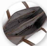
Inside Separate Compartments