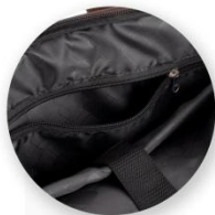
Inside ZIP Pocet