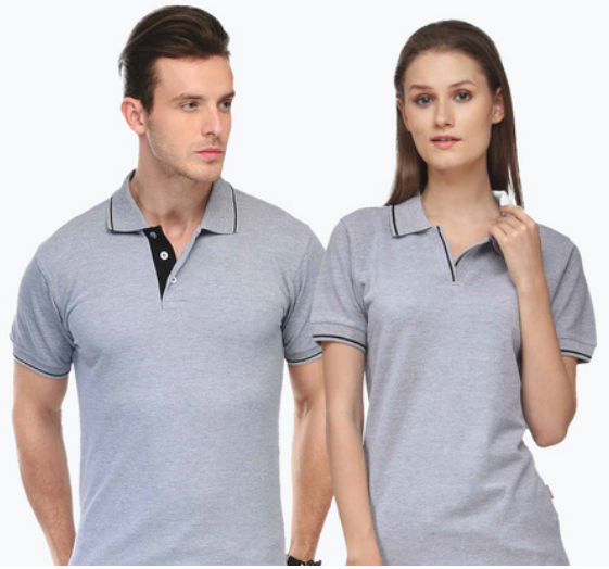
Grey Melange with black Tip