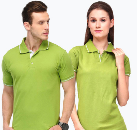
Apple Green with White Tip