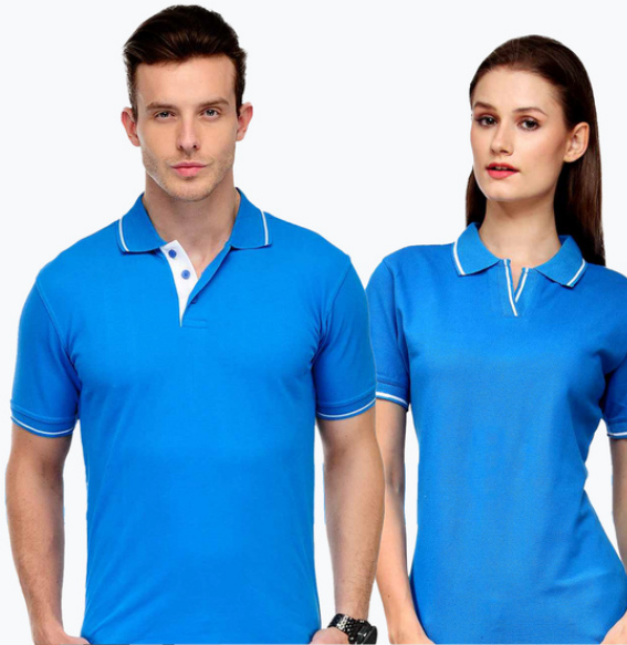
Light Blue with White Tip