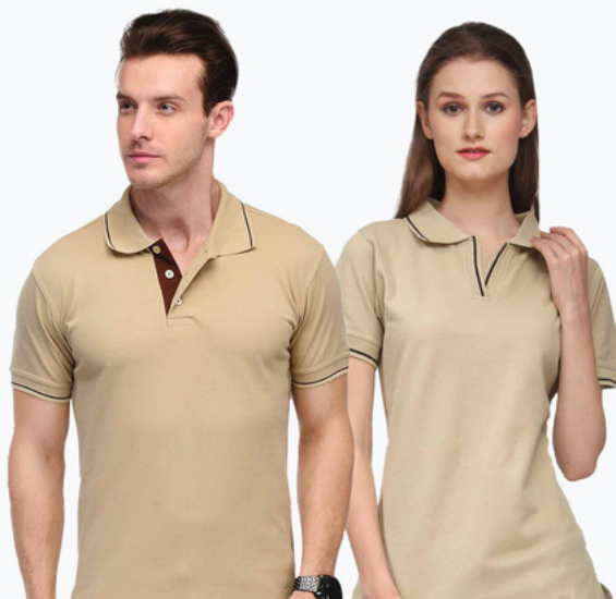
Beige with Brown Tip