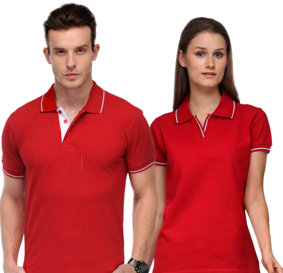
Red with White Tip