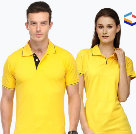
Cream with RedTip