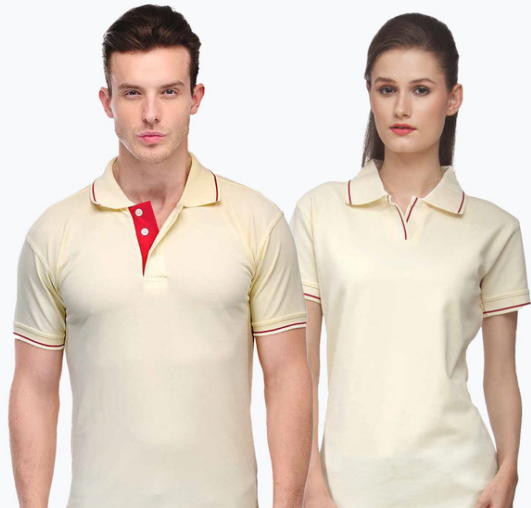
Cream with RedTip