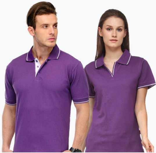
Purple with White Tip