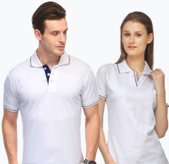
White Blue Tip