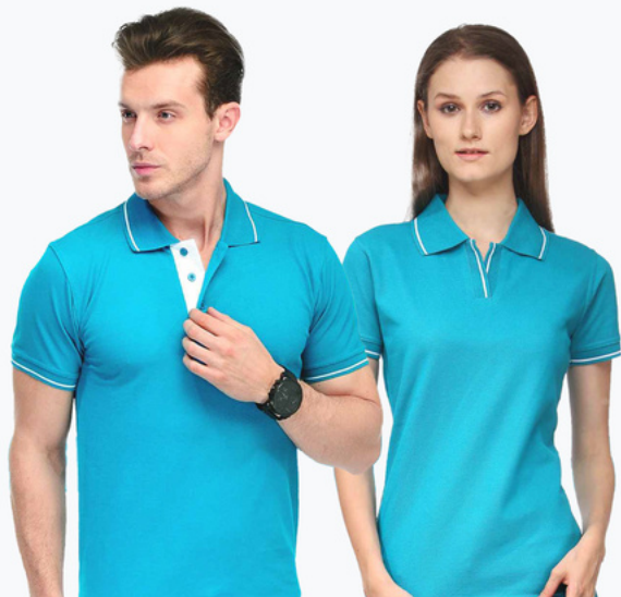
Turquoise Green with White Tip