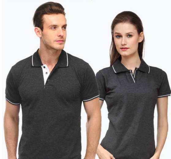
Charcoal Grey with White Tip