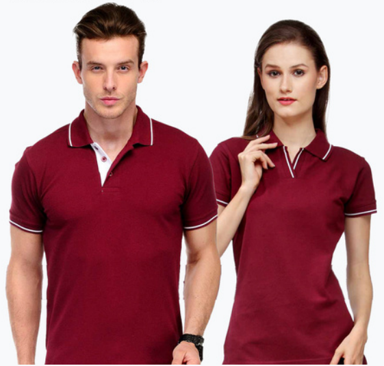
Maroon with White Tip