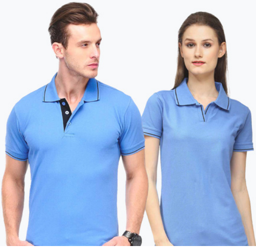
Indian Blue with BlackTip